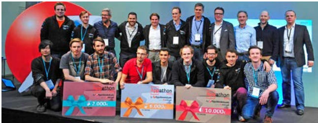
Die Sieger des Appathon 2015 HVB/Unicredit

UniConcierge, TeenWallet and couch Banking are the winners of the first international teams Unicredit Appathon 2015 - and shared a whopping 18,000 euros prize money. At the weekend in Munich, Milan and Vienna around 300 FinTech specialists, web designers and app developers had met to develop innovative ideas for solutions and apps that have the potential to enrich the future of digital banking.