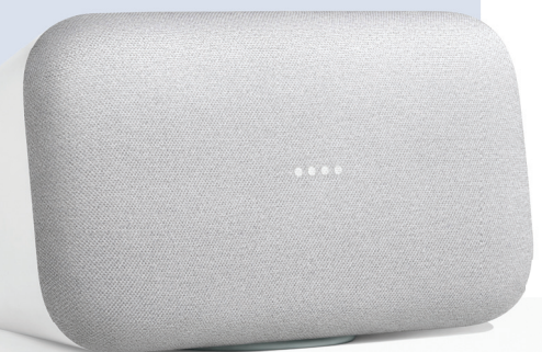
Google Home Max is the search engine's premium smart speaker