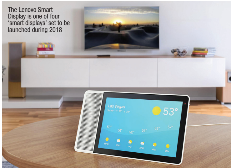
The Lenovo Smart Display is one of four 'smart displays' set to be launched during 2018