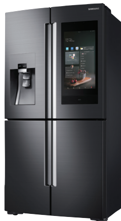
Samsung's FamilyHub fridge is now compatible with its own Bixby voice platform

It's not just consumer electronics that are getting the voice treatment. At CES, Whirlpool added Google Assistant and the Amazon Alexa assistants to its Smart Front-Control Range of appliances, while Samsung went its own way by adding its own Bixby voice-control tech to its Family Hub