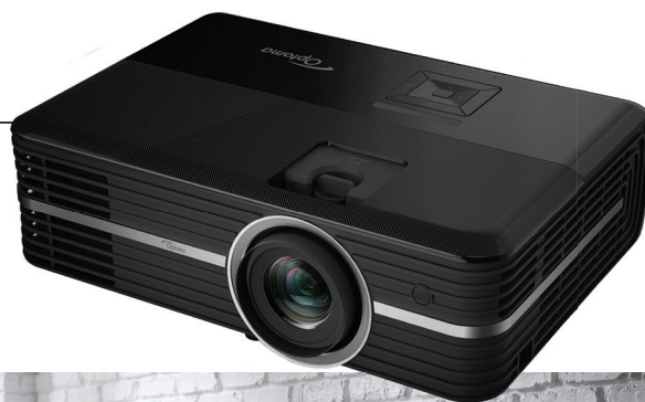
Right: The Optoma UHD51A is one of the first voice-activated projectors