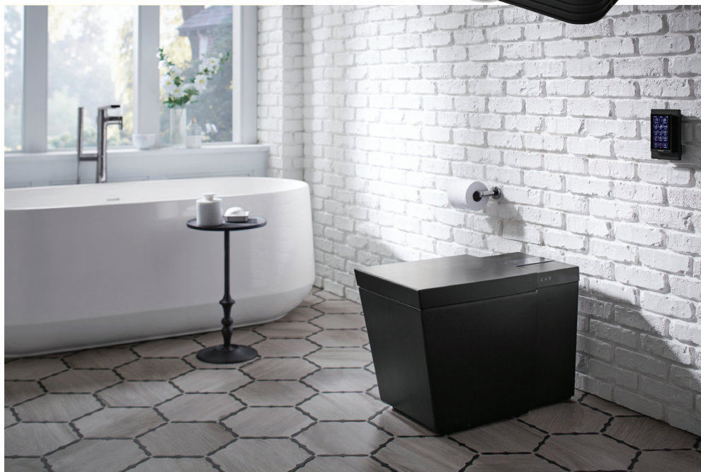
Below: 'Alexa, flush the toilet' is something Kohler's Numi smart toilet will be hearing a lot

smart fridge. Bixby will soon be able to distinguish between different voices.