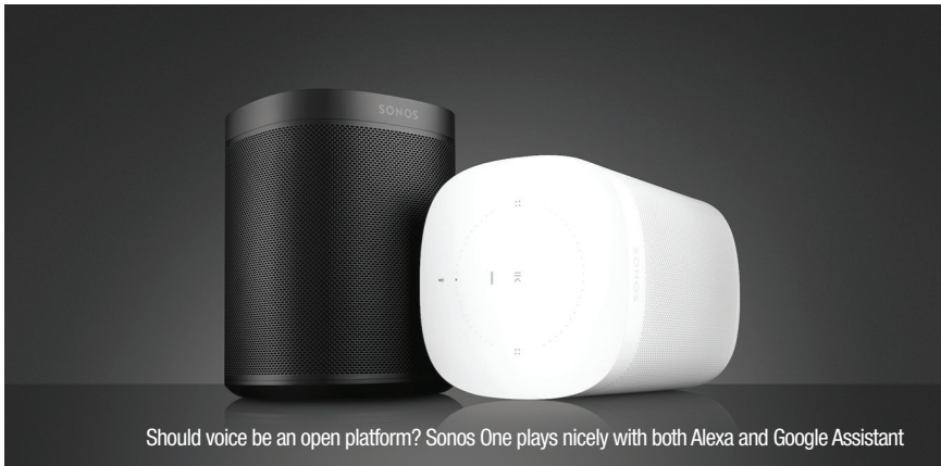
Should voice be an open platform? Sonos One plays nicely with both Alexa and Google Assistant