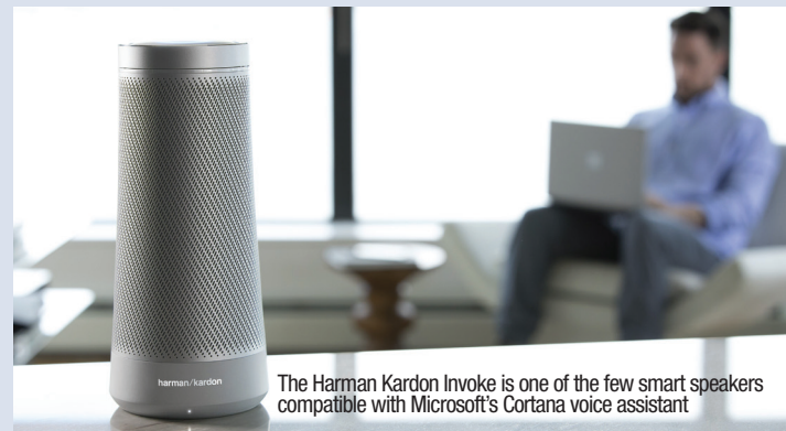
The Harman Kardon Invoke is one of the few smart speakers compatible with Microsoft's Cortana voice assistant