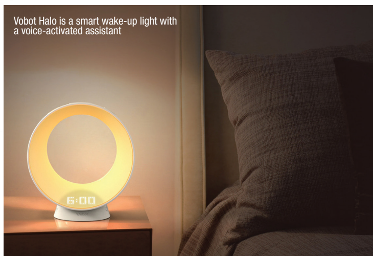
Vobot Halo is a smart wake-up light with a voice-activated assistant

Home being fairly basic in terms of sound quality, one of the biggest segments could be smart speaker upgrades, as early adopters begin to fit out extra rooms with smart speakers. CES saw the debut of the LG ThinQ Speaker WK7, a voice-activated smart speaker developed with Meridian Audio that can output in 24bit/192kHz Hi-Resolution Audio and 24-bit up-sampling. It uses Google Assistant rather than Alexa, and also works as a smart-home hub, with a voice-activated interface for LG's other smart-home appliances.