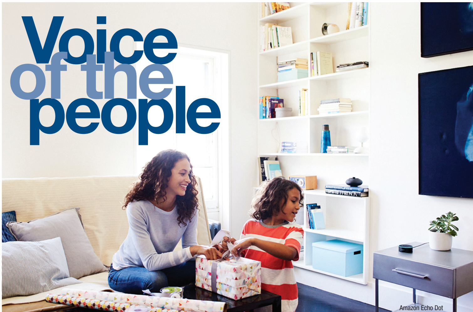
Amazon Echo Dot